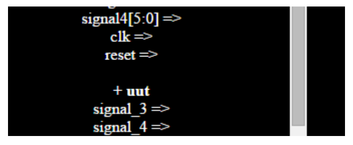
Fig. 3. The list of signals divided by their modules.

The next thing we have to do is creating the list of signals available. This is done as shown in Figure 3 by nested "div" elements for the modules with the signal names inside them as "span" elements which trigger an event upon been clicked. This event adds the signal to an array with the signals to be displayed and calls the function to draw the waveforms.